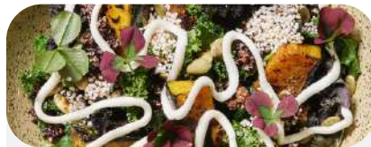
PSEUDOCEREALS AND PUMPKIN. loche squash, yacón, kale