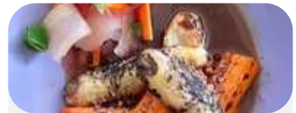
FIRE-ROASTED TUBERS. native potatoes, roasted chili peppers, Andean herbs