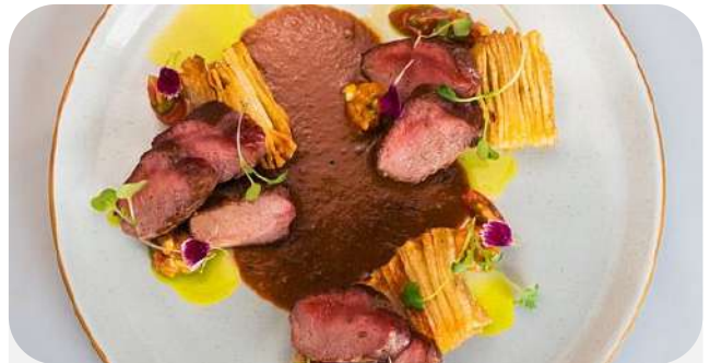
Recommended dishes: Huarocado (pork with pumpkin purée) and braised ossobuco with tarwi purée. A more private space is available on the second floor for the group.