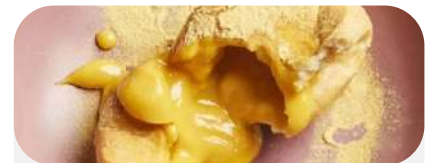
LÚCUMA. Maras salt, coffee, arrayán