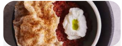
ALPACA CRUDO. lemon verbena, moraya, aji panca