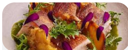
CONFIT PORK BELLY. arracacha, maca, quince