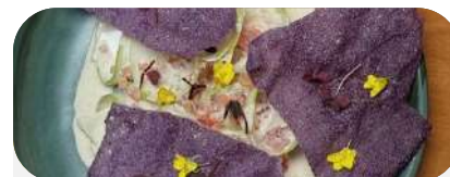
CECILIANO AND AMAZONIAN CHESTNUT. broad beans, eggplant, mint