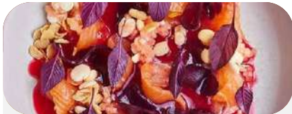
COLD TROUT & GREEN TUNA. cucumber, tarwi