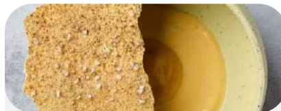
CITRUS. sanki, Cara Cara orange, kunuka