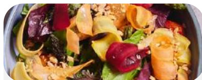
SEASONAL SELECTION. sanki, carrot, olluco, aged cheese, mint