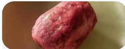
PRICKLY PEAR (TUNA). pitahaya, yogurt