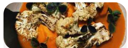
TROUT IN AJÍ SAUCE. Huamantanga potato, charred cauliflower