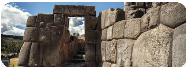
Sacsayhuamán: Monumental military fortress with massive stone walls and panoramic views of the city.

Explore Inca architecture and engineering in the surroundings of Cusco. The tour includes: