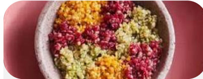
ALTIPLANO GRAINS. kiwicha, kañiwa, pumpkin