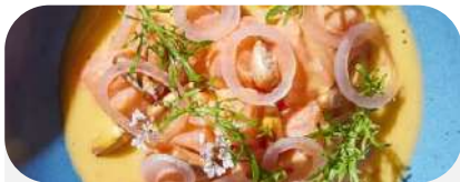
CEVICHE AT 3,000 METERS. trout, high-altitude citrus, Cusco onions