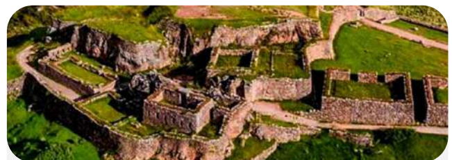
Puca Pucara: Ancient red fortress and strategic resting site for imperial troops.