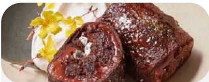
CACAO. cacao textures, sweet cream