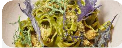
CUSCO-STYLE "NOODLES". stewed duck, aguaymanto, jora