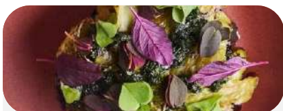
SLOW-COOKED BEEF CHEEK. giant corn, yuyo de pampa, aji amarillo