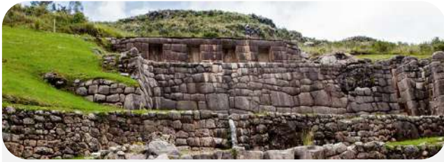
Tambomachay: Water worship center known for its cascades and advanced hydraulic engineering.