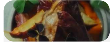
SKIRT STEAK WITH AJÍ PANCA. native potatoes, rocoto