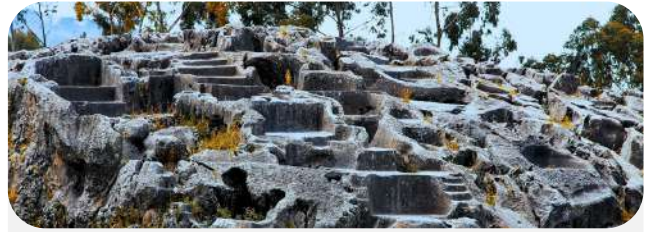
Kenko: Ceremonial center with underground passages dedicated to astronomical and agricultural rituals.

Includes the Cusco Partial Tourist Ticket.