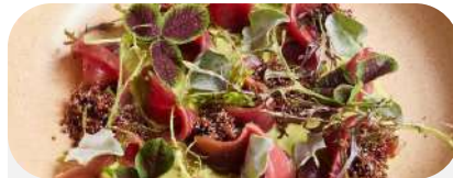
SMOKED DUCK. coca leaves, maca-kunuca, avocado, kañiwa