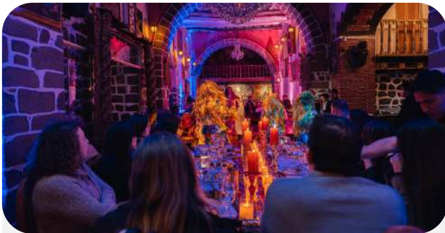
Three-course à la carte menu Offers a dinner show daily at 7:00 p.m. Specializes in signature cuisine with local ingredients.