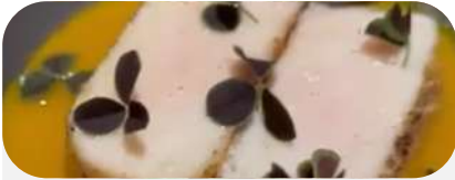
PAICHE (AMAZONIAN FISH). high jungle juices, cocona, rough lemon, yuca